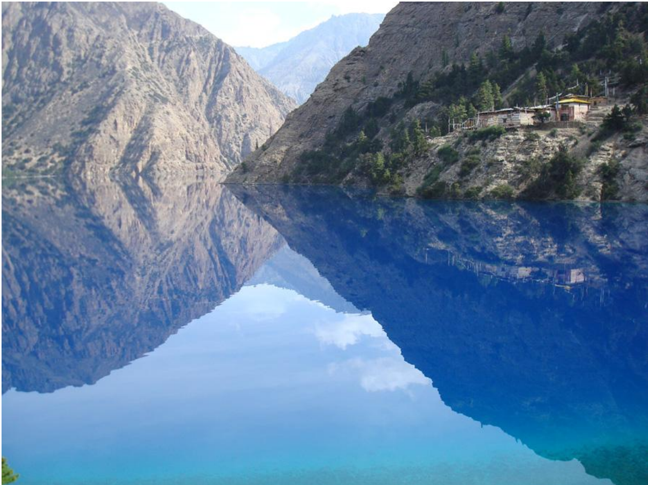
Bönpo gumpa (monastery) overlooking Phoksumdo Lake, Dolpo