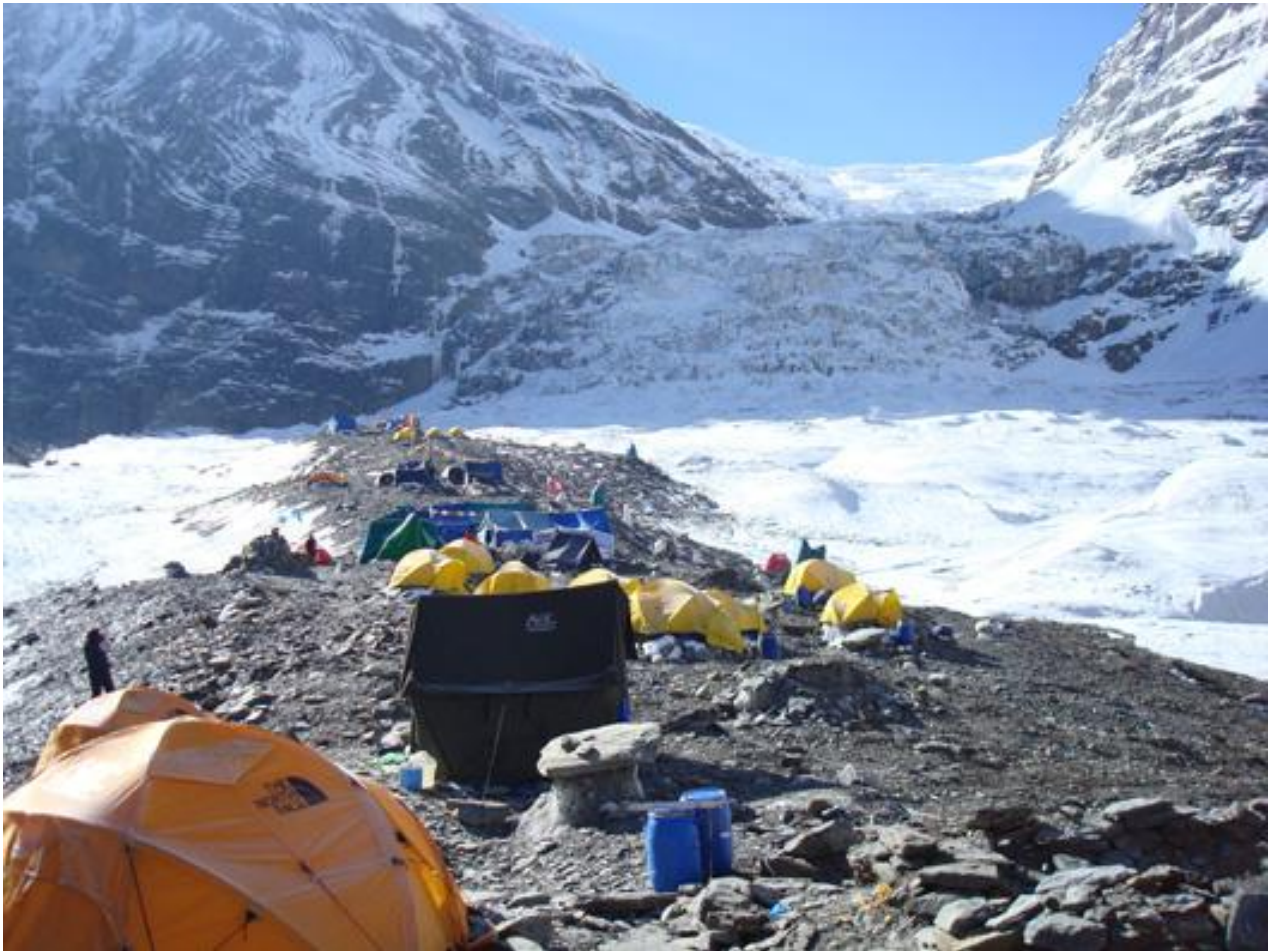
Dhaulagiri Base Camp