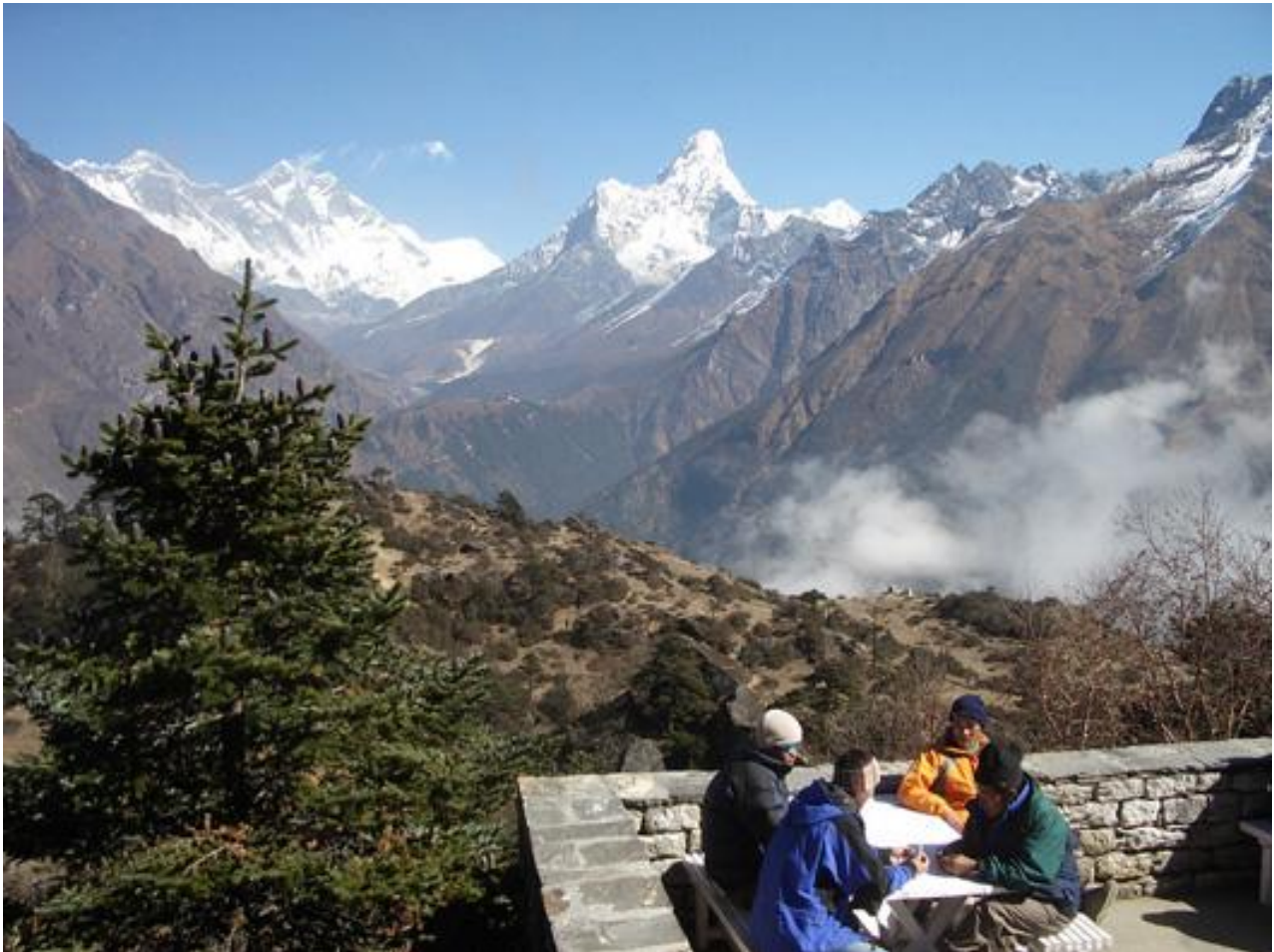
Terrace of Everest View Hotel with Mount Everest and Mount Ama Dablam down the valley