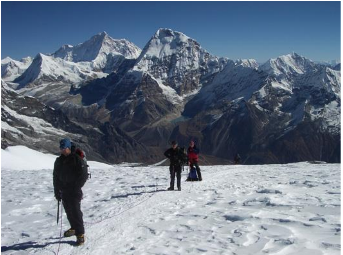
Summit day on Mera Peak with Mount Makalu behind