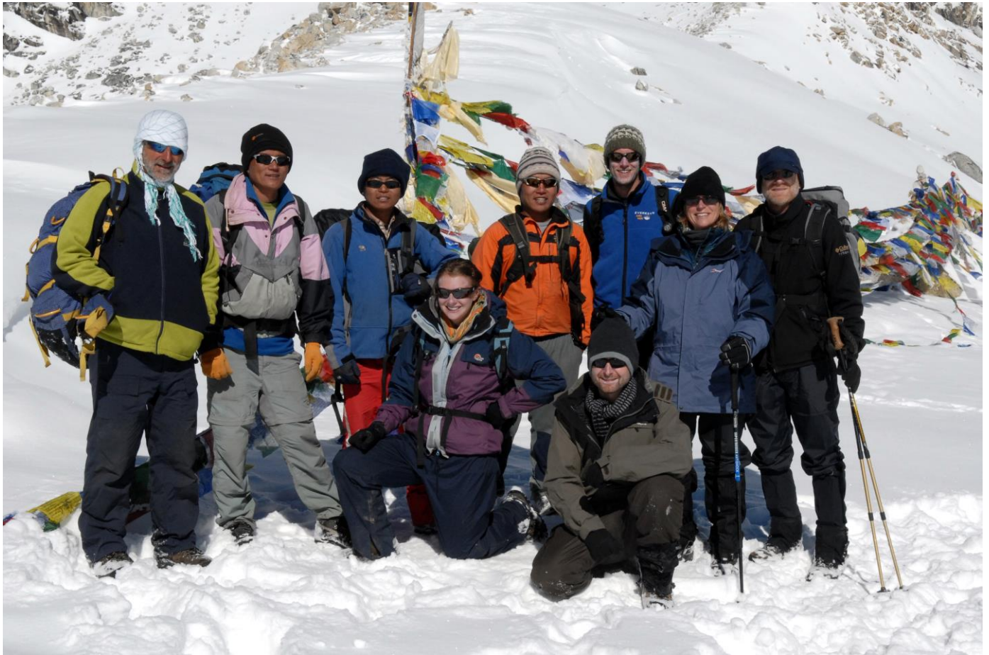
Group at Larkya La pass on the Manaslu Circuit